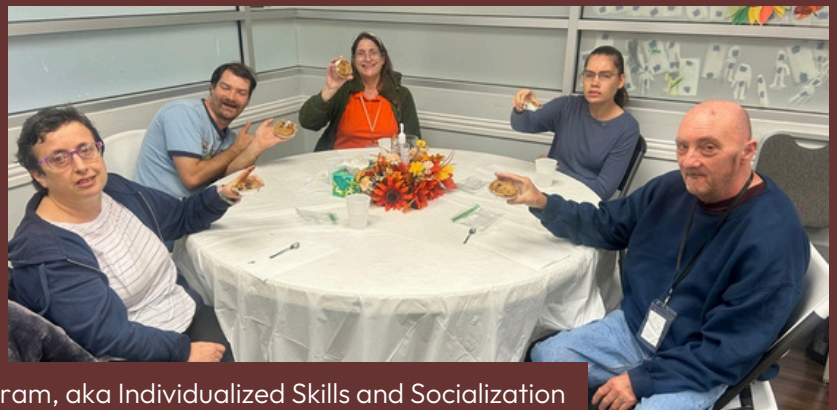
Craft day at our Wolens Day Program, aka Individualized Skills and Socialization