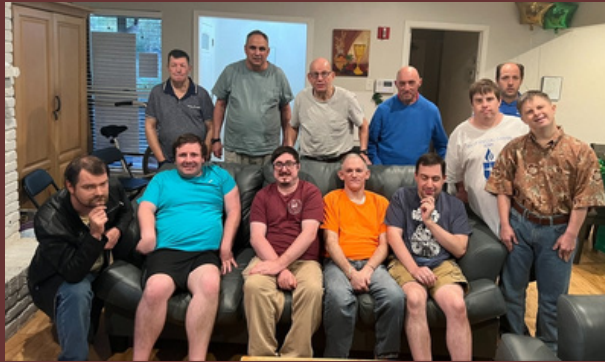
Some of the gentlemen of CHAI