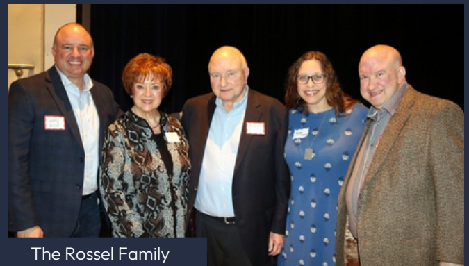
The Rossel Family